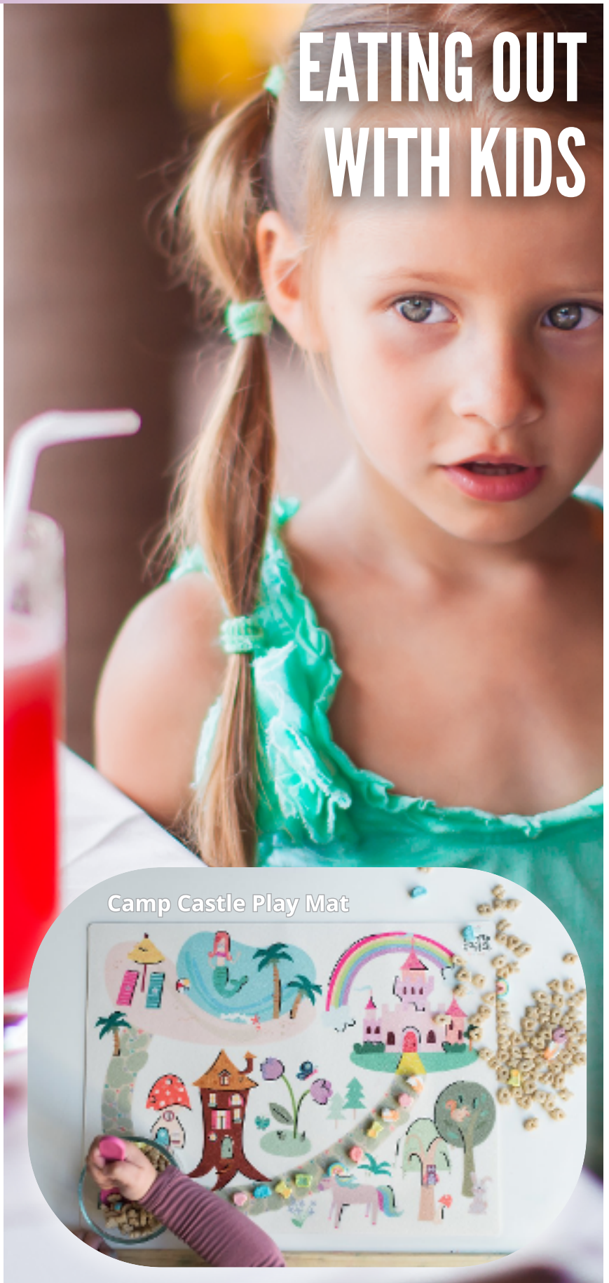
Camp Castle Play Mat