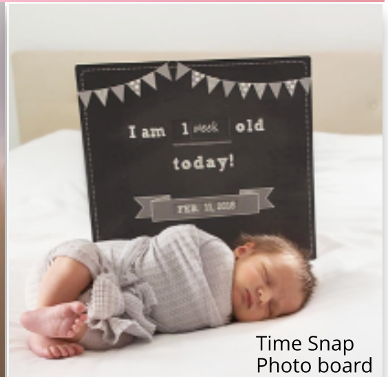
Time Snap Photo board