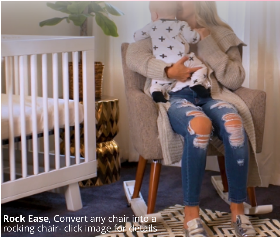
Rock Ease , Convert any chair into a rocking chair- click image for details