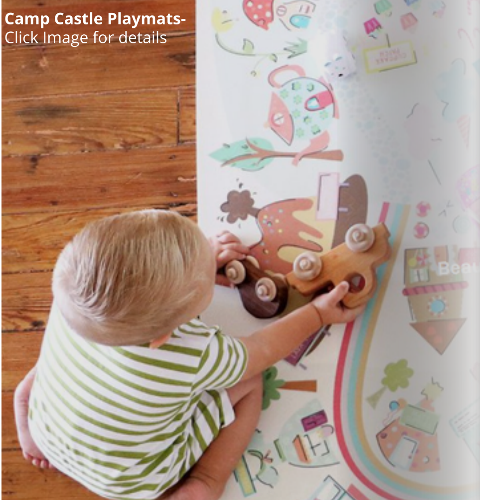
Camp Castle Playmats- Click Image for details