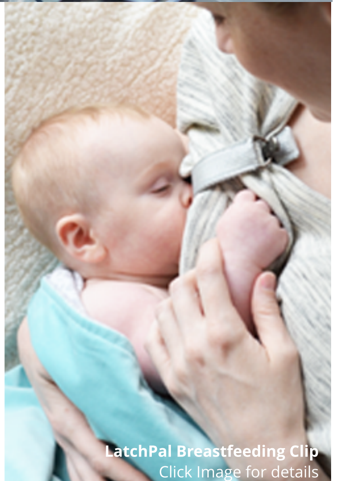
LatchPal Breastfeeding Clip Click Image for details