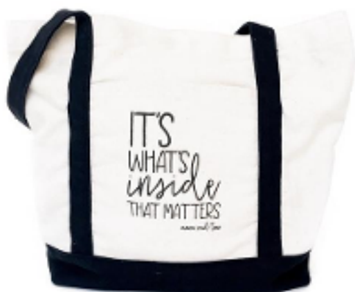
Messages of love and kindness, Everykind offers unique products with positive messaging.