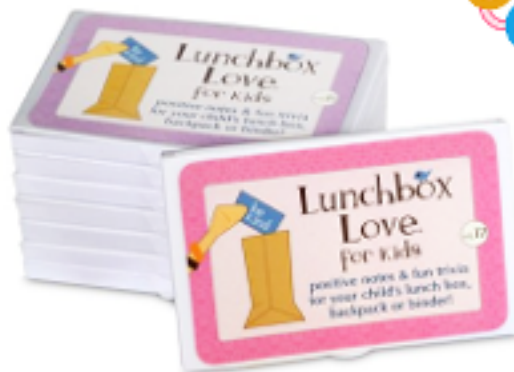
Pocket sized notes cards that brighten the days of those you love!