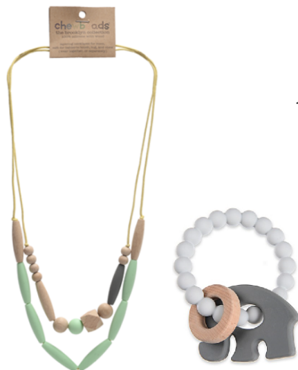
Chewable fashion Jewelry + teether, the Chewbeads Brooklyn Collection.

Based on a study found in the Journal of Social Psychology , people who performed a single kind act a day for ten days experienced a significant increase in overall happiness?