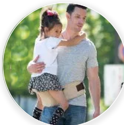
Men with hips...the convertible HUGGS carrier transforms into a hip seat, new from Abiie.