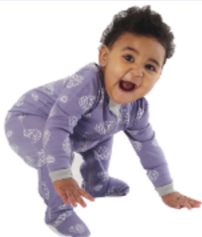
Pajamas with a conveniently located zipper to simplify diaper changes from Zippy Jamz